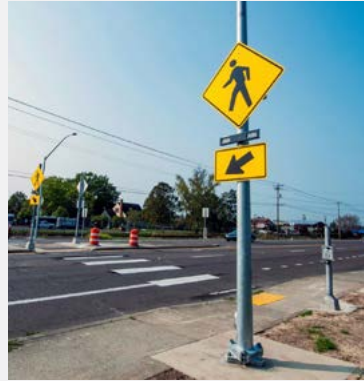
Example of a completed Rectangular Rapid Flashing Beacon (RRFB) crosswalk, creating a safer and more visible pedestrian crossing along a busy corridor.

The TV Highway (OR 8) Pedestrian Safety Project in Aloha and Beaverton is designed to reduce crashes and improve the safety of people walking and bicycling between SW 153rd Drive and SW 182nd Avenue. This stretch of TV Highway is a 35-45 MPH highway with narrow shoulders and long distances between safe crossings. This is a partnership project with Washington County. Construction begins in 2025.